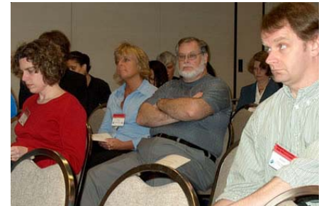
Conferees gain valuable insight into research administration.

The Crowne Plaza Hotel adjacent to the historic Union Station in lively downtown Indianapolis proved to be a delightful setting for the meeting: Railway cars converted into hotel rooms, nostalgic period statues scattered throughout the hotel, and a host of good restaurants within walking distance were just a few of the features enjoyed by the attendees.